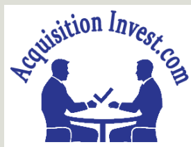
AcquittionInvest.com Custom CMS Powered Website in PHP and MariaDB