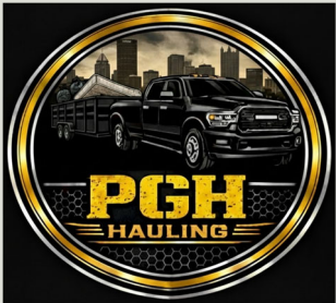
PghHauling.com Custom Designed Website and jQuery Photo Gallery